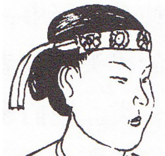
Figure 1. Tang woman with hair band

Among the unearthed cultural relics of the Tang Dynasty, such as pottery figurines and tomb murals, a common type of female image with the hair band is found. Examples include murals in Duan Jianbi Tomb of Zhaoling in Tang Dynasty (Figure 1), murals in the Tomb of the Princess Xincheng of Tang Dynasty, the figure of women in men's clothes depicted in murals of Wei Concubine's Tomb found in Liquan County, maiden figurines unearthed in the Tang Tomb of Shilipu Village in the East Suburb Luoyang, the maiden figure with Hu bottle painted in murals of An Yuan-shou's Tomb in Liquan County, and the horse riding figures unearthed in the River Road Tang Tomb of Chaoyang, Liaoning Province. The hair bands are all made of brocade and other fabrics, which are weaved into narrow strips and covered on the forehead, with thin ribbons on both sides tied behind the head. These women wear round collar gowns, which belong to men's clothes. Among them, the female figurine in Duan Jianbi Tomb wears a belt, with a knife hanging in the waist; the female figurine in the River Road Tang Tomb of Chaoyang travels on horseback and carries a bottle. This special combination of dress and behavior proves that, the hair band should not be a traditional female headdress in China; it is the imitation of men's hairdo.