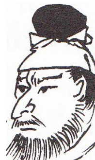
Figure 2. Tang Warrior with Mo'e