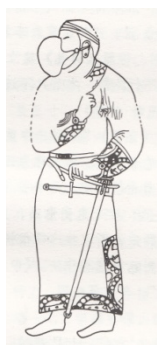
Figure 4. Sogdian with hair band lived in Central Asia